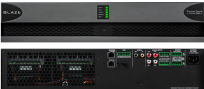
POWERZONE CONNECT 2004D