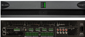
POWERZONE CONNECT 6008D